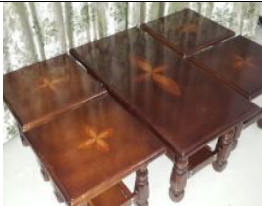
Table set with central table. DIMENSIONS for Table set not leas (60x60cm) and DIMENSIONS for central table not leas (80x90cm).