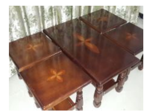
Table set with central table. DIMENSIONS for Table set not leas (60x60cm) and DIMENSIONS for central table not leas (80x90cm).