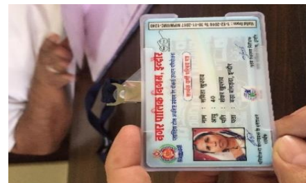
Figure 2: A sample of the Identity Card for the Safaii Mitras.