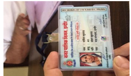
Figure 2: A sample of the Identity Card for the Safai Mitras.