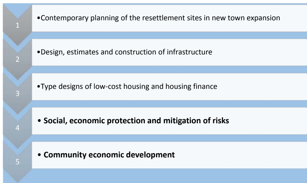
Figure 1: Five areas of Technical Assistance

Research undertaken during the inception phase will build on findings from UN-Habitat's mapping assessment conducted in cooperation with YCDC that identified/verified 423 slum/informal settlements within municipal boundaries. The slum mapping classified informal settlements into seven typologies based on their location and/or development and qualitative socio-economic research on urban poverty and living conditions in Yangon's informal settlements. 1