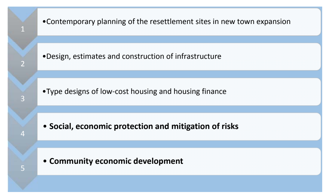
Figure 1: Five areas of Technical Assistance

Research undertaken during the inception phase will build on findings from UN-Habitat's mapping assessment conducted in cooperation with YCDC that identified/verified 423 slum/informal settlements within municipal boundaries. The slum mapping classified informal settlements into seven typologies based on their location and/or development and qualitative socio-economic research on urban poverty and living conditions in Yangon's information settlements.<sup>1</sup>