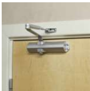
Auto Door Closer