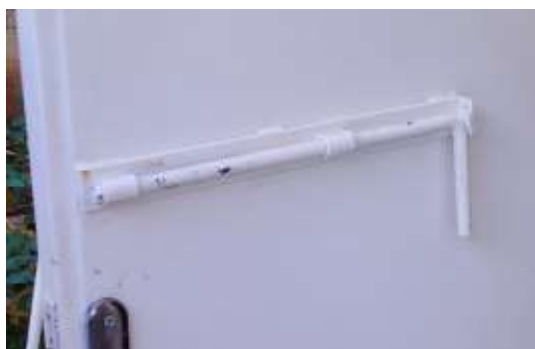
Manual Door lock bar (L-shape 10mm Dia)