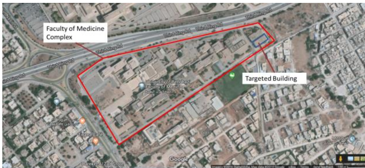
Aerial Photo for Faculty of Medicine and Animal House