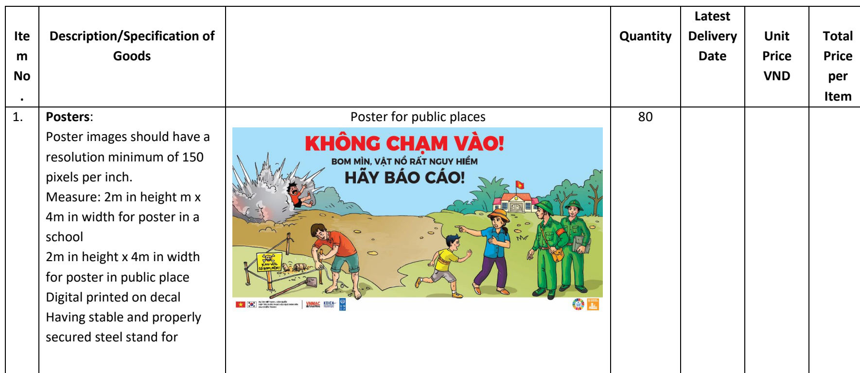
TABLE 1 : Offer to Supply Goods and Services Compliant with Technical Specifications and Requirements

We, the undersigned, hereby accept in full the UNDP General Terms and Conditions, and hereby offer to supply the items listed below in conformity with the specification and requirements of UNDP as per RFQ Reference No. K-190601