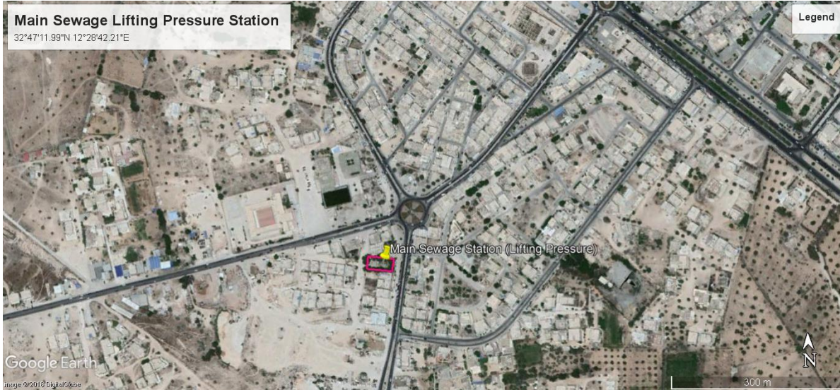
Main (KABOUT) Lifting Sewage Pressure Location Map

Main (KABOUT)/ WADI Lifting Sewage Pressure Station is located in the Sabratha city center, as shown in the attached maps. The lifting stations suffered damages due to lack of proper maintenance of the buildings and the equipment causing serious impact on proper operation of the lifting station. Main (KABOUT)/ WADI Lifting Sewage Pressure Stations consist of two small buildings, housing sewage pumps, solid wastewater materials grinders, and air ventilations units.