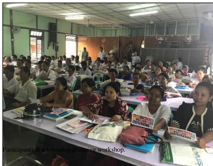
Participants at a township planning workshop.

The project strengthens township administrations' capacities to better facilitate inclusive annual planning processes and develops skills in public financial management by providing trainings and on-the-job support in all aspects of inclusive development planning and the budget execution cycle.