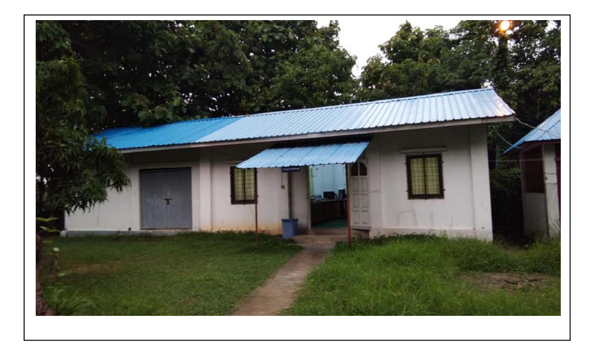
Photo 1 - Front of the Building. The room covered by the yellow curtain is DOT Office which is separated by the concrete wall.