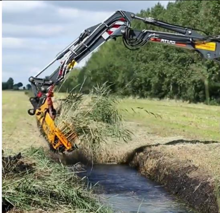
Mowing bucket analog