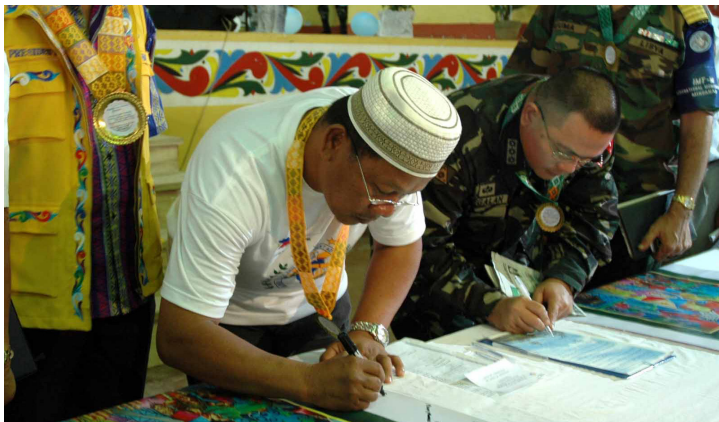
Army, Marawi officials officially sign peace covenant

How can a country develop—how can people eat and teach and learn and work and raise families—without peace? And how can a country have peace without justice, without human rights, without government based on the rule of law? Some regions of the world enjoy relative peace and justice, and may come to take it for granted. Other regions seem to be plagued by armed conflict, crime, torture and exploitation, all of which hinders their development. The goal of peace and justice is one for all countries to strive towards. The Sustainable Development Goals aim to reduce all forms of violence and propose that governments and communities find lasting solutions to conflict and insecurity. That means strengthening the rule of law, reducing the flow of illicit arms and bringing developing countries more into the center of institutions of global governance.