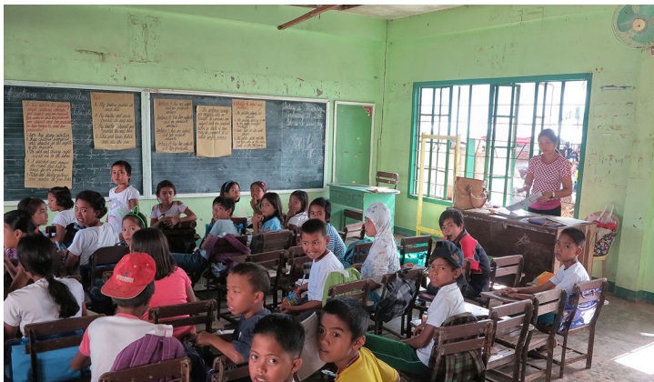
Fisherman's Village Elementary School in Tacloban City

First, the bad news on education. Poverty, armed conflict and other emergencies keep many, many kids around the world out of school. In fact, in developing regions, kids from the poorest households are four times more likely to be out of school than those of the richest households.