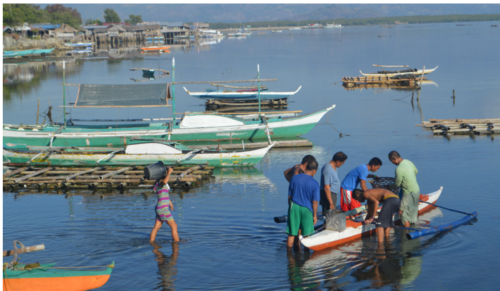
Fishermen coming back to the shore, Dumaguete, Philippines

The oceans make human life possible. Their temperature, their chemistry, their currents, their life forms. For one thing, more than 3 billion people depend on marine and coastal diversity for their livelihoods. But today we are seeing nearly a third of the world's fish stocks overexploited. That's not a sustainable way of life. Even people who live nowhere near the ocean can't live without it.