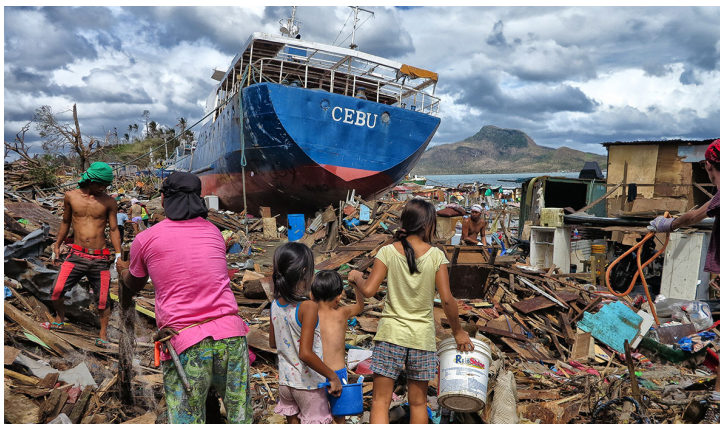
The Cebu sailed 100 metres inland and came to rest on dozens of houses during typhoon Haiyan in Eastern Visaya

Every country in the world is seeing the drastic effects of climate change, some more than others. On average, the annual losses just from earthquakes, tsunamis, tropical cyclones and flooding count in the hundreds of billions of dollars. We can reduce the loss of life and property by helping more vulnerable regions—such as land-locked countries and island states—become more resilient. The impact of global warming is getting worse. We're seeing more storms, more droughts and more extremes than ever before. It is still possible, with political will and technological measures, to limit the increase in global mean temperature to two degrees Celsius above pre-industrial levels—and thus avoid the worst effects of climate change. The Sustainable Development Goals lay out a way for countries to work together to meet this urgent challenge.