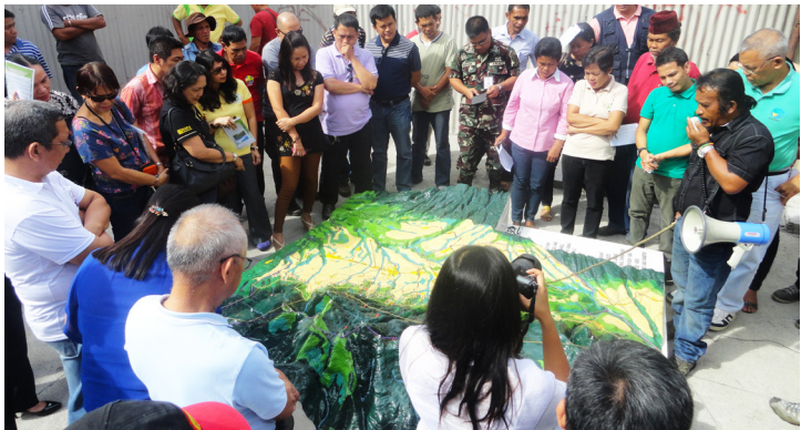
Image from the Mount Tapulao Conservation Project in Zamboanga

Humans and other animals rely on other forms of life on land for food, clean air, clean water, and as a means of combatting climate change. Plant life makes up 80% of the human diet. Forests, which cover 30% of the Earth's surface, help keep the air and water clean and the Earth's climate in balance. That's not to mention they're home to millions of animal species. But the land and life on it are in trouble. Arable land is disappearing 30 to 35 times faster than it has historically. Deserts are spreading. Animal breeds are going extinct. We can turn these trends around. Fortunately, the Sustainable Development Goals aim to conserve and restore the use of terrestrial ecosystems such as forests, wetlands, drylands and mountains by 2020.