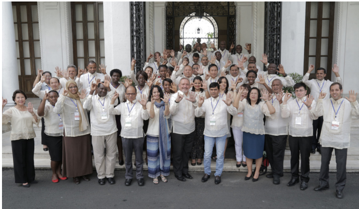
Representatives from the 20-member Climate Vulnerable Forum together with 23 incoming members from Africa, Asia, the Caribbean, Latin America, the Middle East, and the Pacific met at Manila and agreed to move unitedly to strengthen their collaboration and domestic climate action to trigger increased commitments from all countries and seize the COP21 opportunity for a climate-secure framework to keep warming below 1.5oC.

The Sustainable Development Goals are pretty big to-do list, don't you think? In fact, it's so big, you may just want to throw your hands up in the air. "Forget it! Can't be done! Why even try!" But we've got a lot going for us. The world is more interconnected today than ever before, thanks to the internet, travel and global institutions. There's a growing consensus about the need to work together to stop climate change. And the Sustainable Development Goals are no small matter either. 193 countries agreed on these Goals. Pretty incredible, isn't it? 193 countries agreeing on anything? The final Goal lays out a way for nations to work together to achieve all the other Goals.