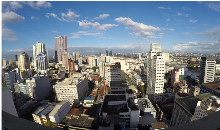
Makati skyline

If you're like most people, you live in a city. More than half the world's population now lives in cities, and that figure will go to about two-thirds of humanity by the year 2050. Cities are getting bigger. In 1990 there were ten "mega cities" with 10 million inhabitants or more. In 2014, there were 28 mega cities, home to 453 million people. Incredible, huh? A lot of people love cities; they're centers of culture and business and life. The thing is, they're also often centers of extreme poverty. To make cities sustainable for all, we can create good, affordable public housing. We can upgrade slum settlements. We can invest in public transport, create green spaces and get a broader range of people involved in urban planning decisions. That way, we can keep the things we love about cities and change the things we don't.