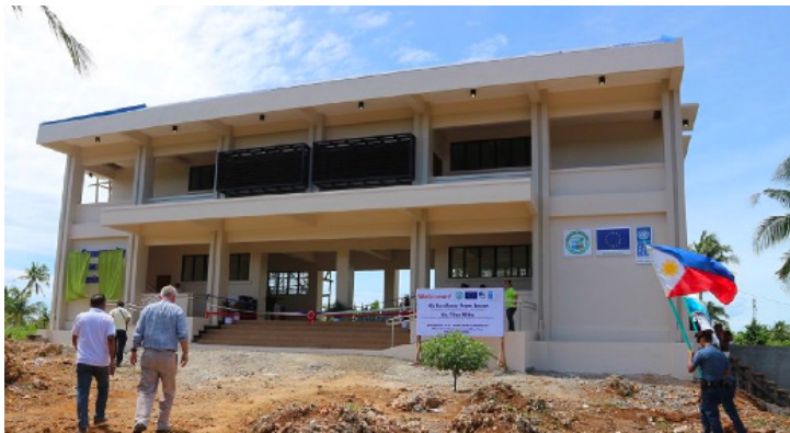
UNDP continues to support recovery and rehabilitation in areas affected by Yolanda with more disaster resilient infrastructure and livelihood