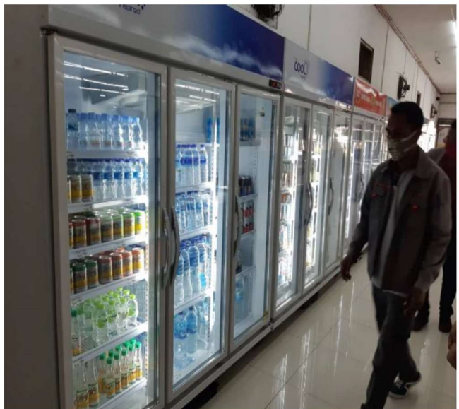
Figure 3- Standalone showcase for Drinks