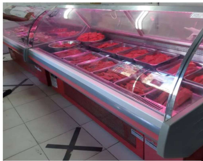
Figure 2- Standalone Display Unit for Meat Storage