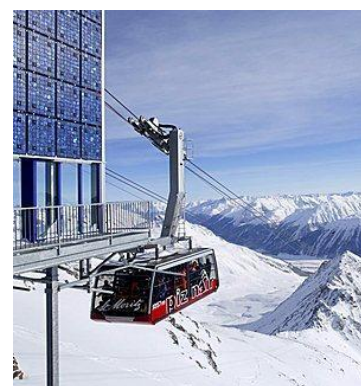
Figure 2 Example of solar energy driven cable car (Switzerland)

Main objective of Study on possibilities for using renewable energy