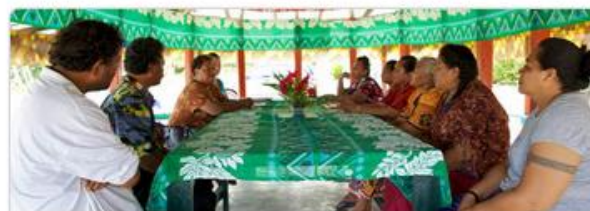
Leading for change