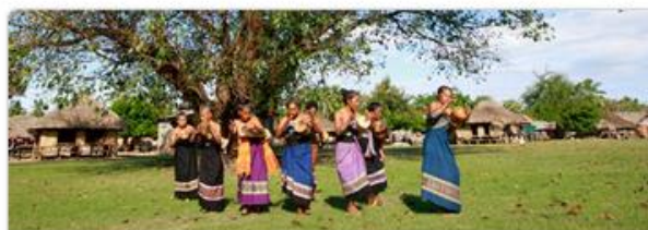
Sustaining energy and the environment