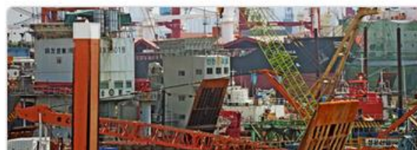
Accessing, owning and controlling resources