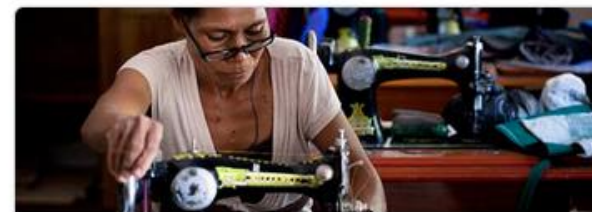
Transforming the workplace