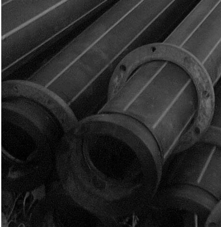
Picture 3. Example of pipes.