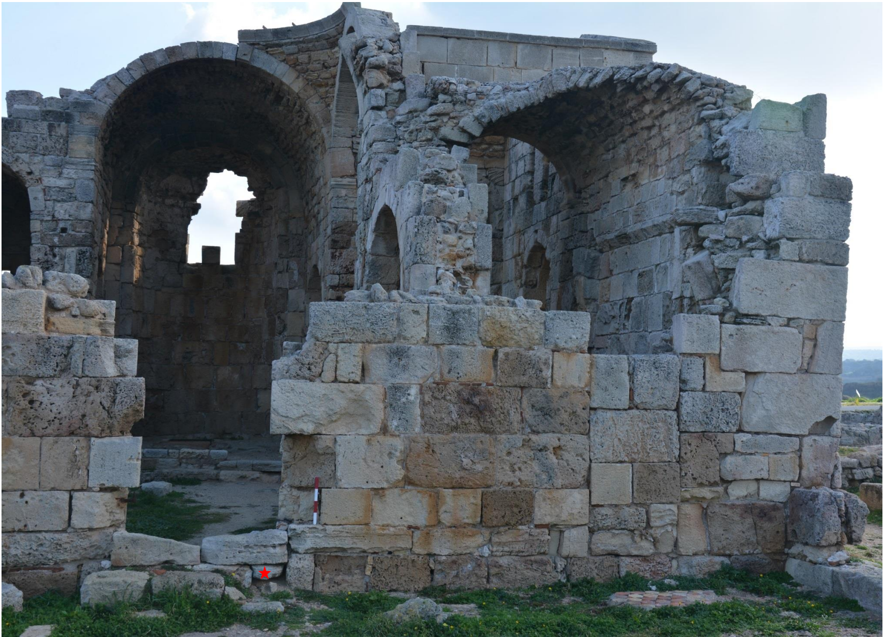
★ Stone to be removed in order to facilitate the rainwater flowing outside the church