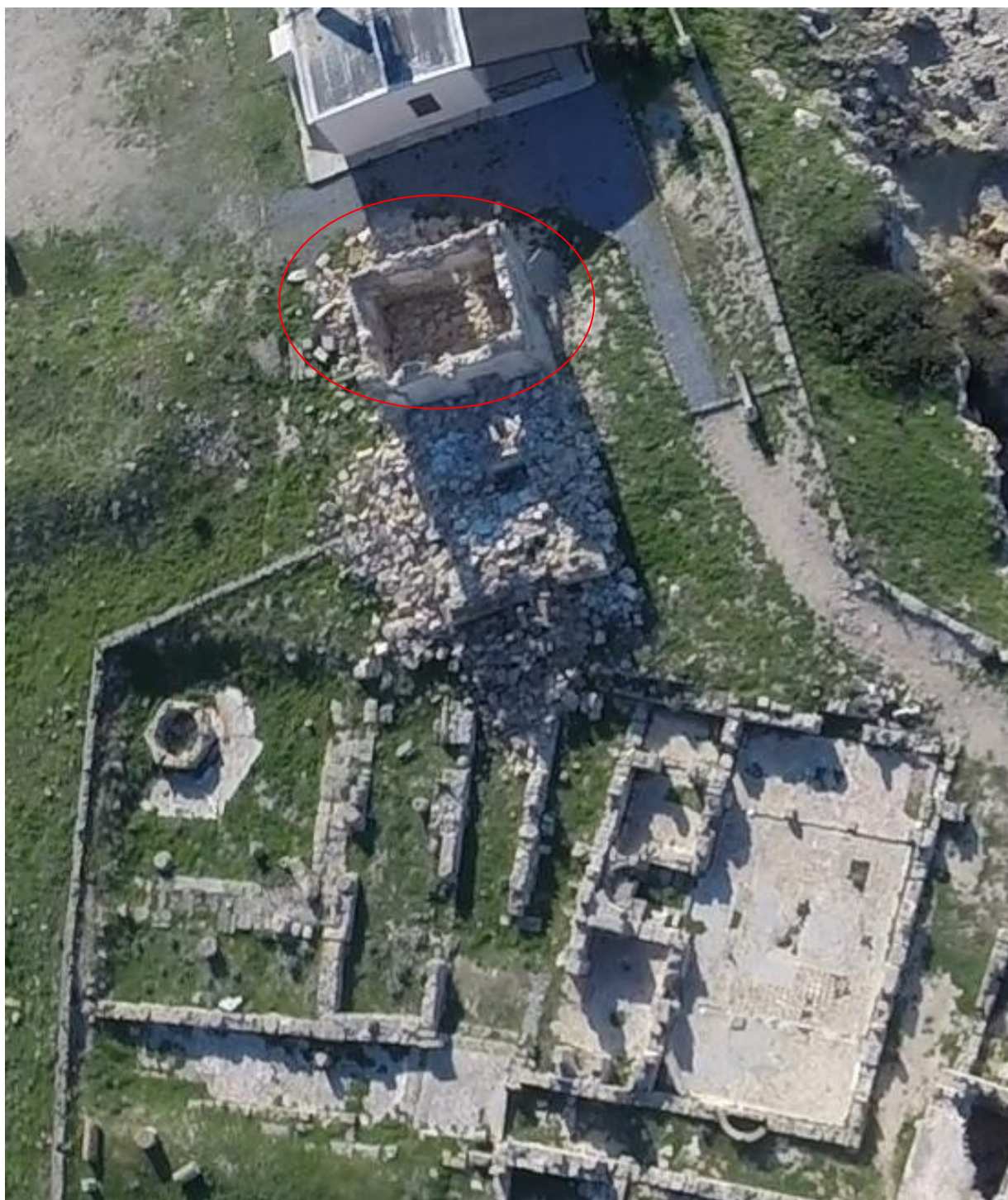
Fig. 2: The 'Dig House'. Room to be restored.