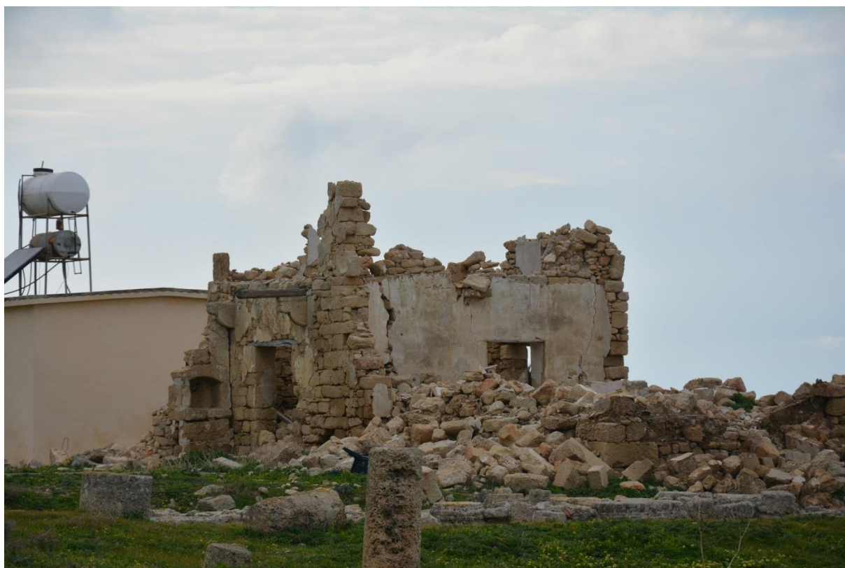
Fig. 5: Southeast view of the house.