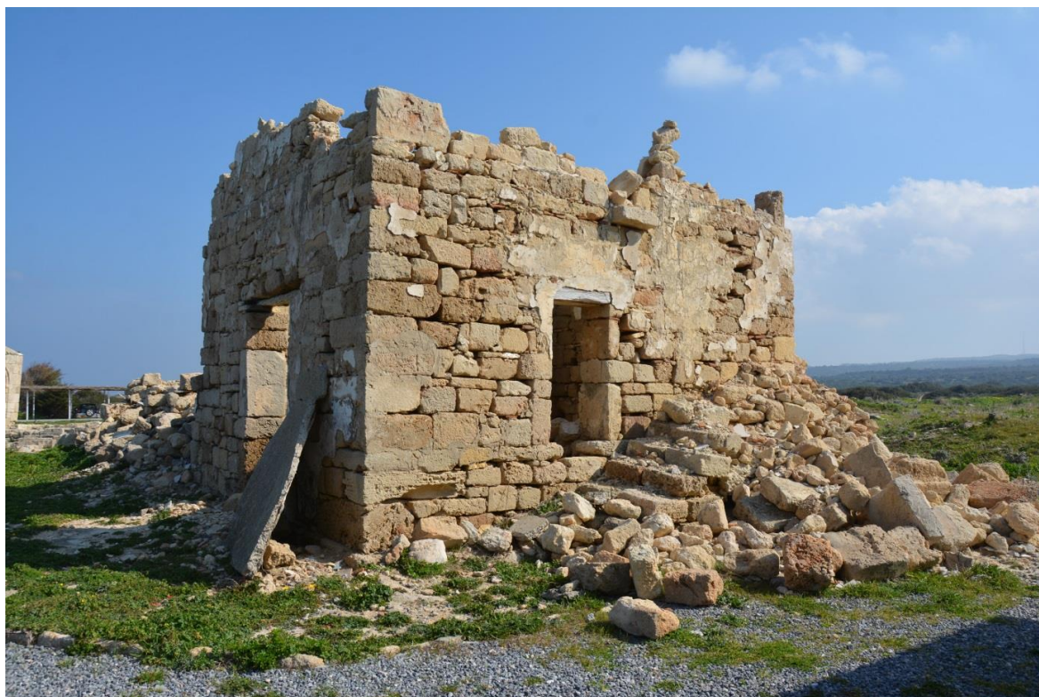
Fig. 4: Northwest view of the house.