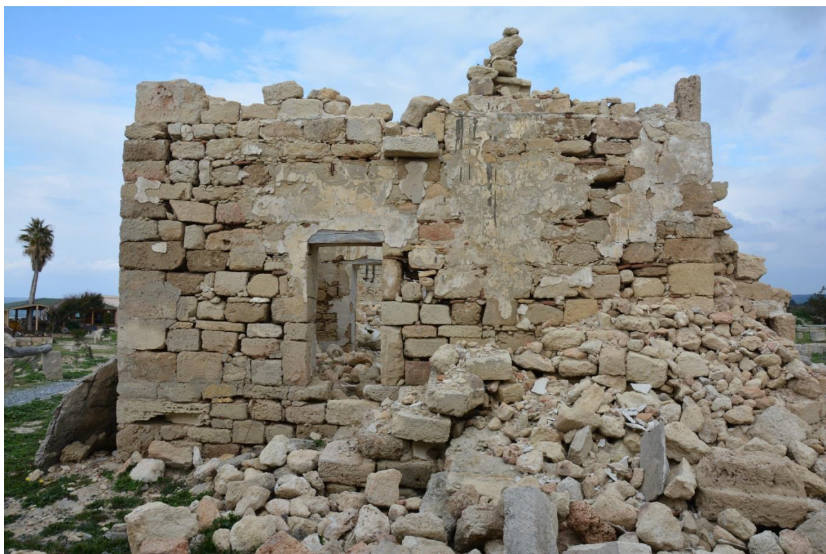
Fig. 3: West facade of the house. Traces of the staircase to be preserved.