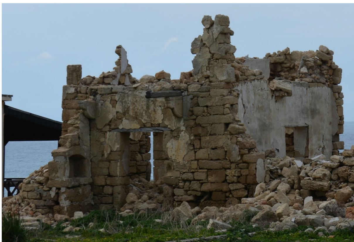
Fig. 6: South facade of the house. Traces of balcony and niche to be preserved.