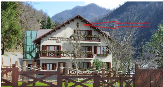
10. inscription on the facade