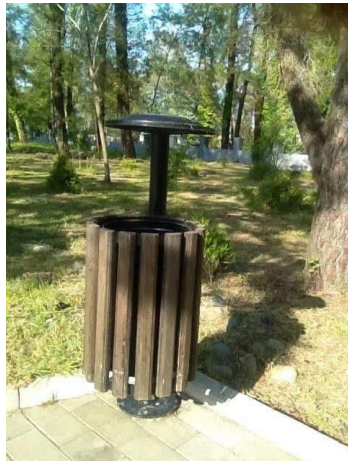
8. Urn. Design/color to be agreed with client