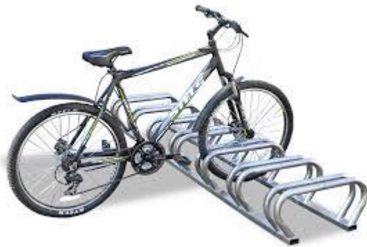
7. Bicycle parking