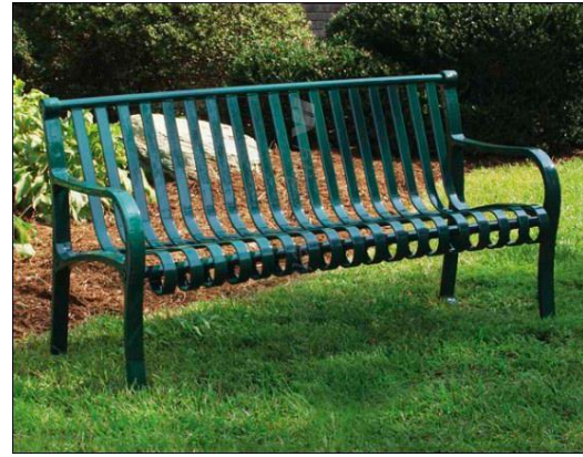
9. square metal benches. Design/color to be agreed with client