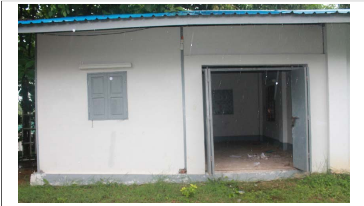
Photo 2 - Front of the Building.