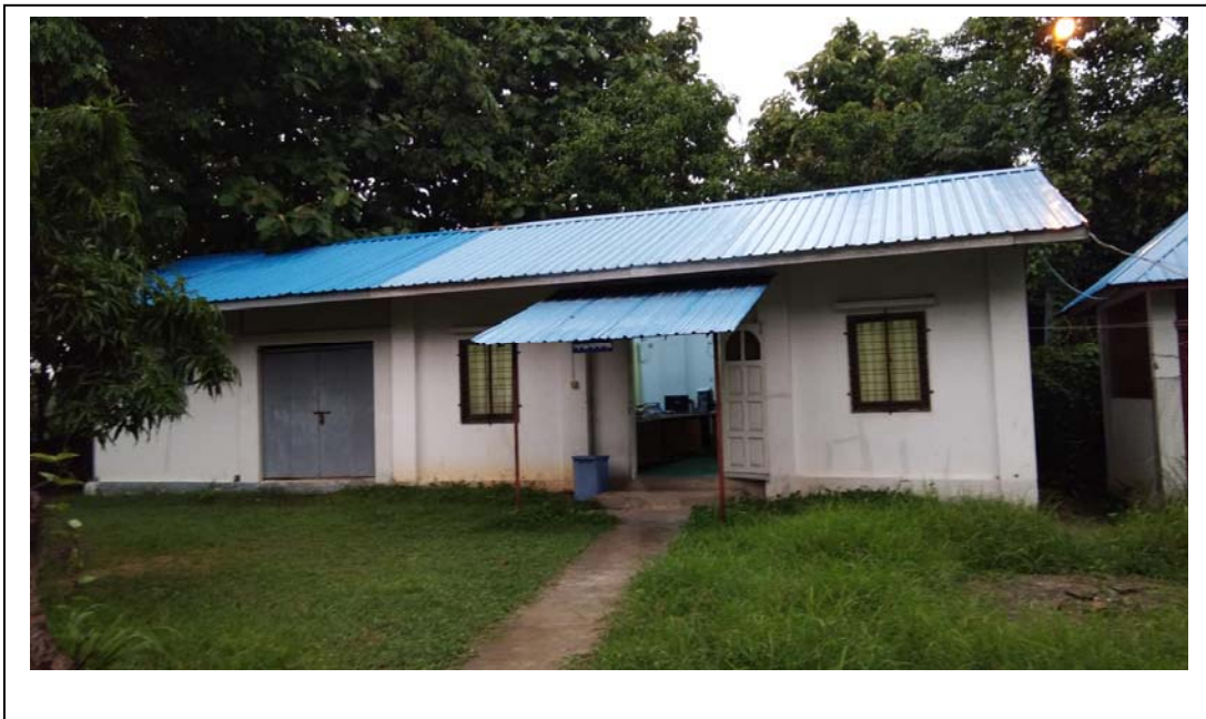
Photo 1 - Front of the Building. The room covered by the yellow curtain is DOT Office which is separated by the concrete wall.