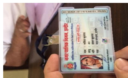
Figure 2: A sample of the Identity Card for the Safai Mitras.