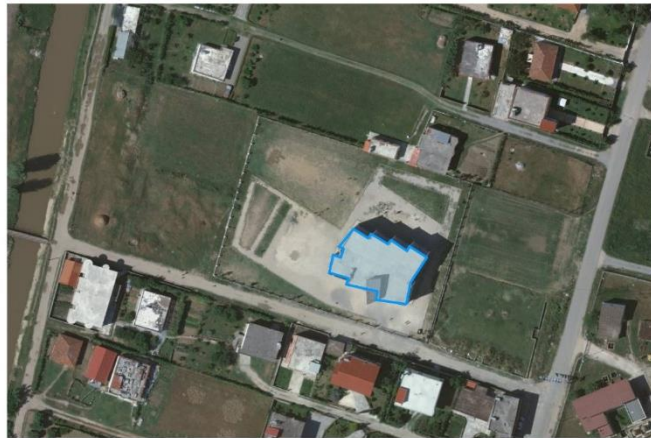
SH.9 VJECARE DOM NIKOLLE KACORRI