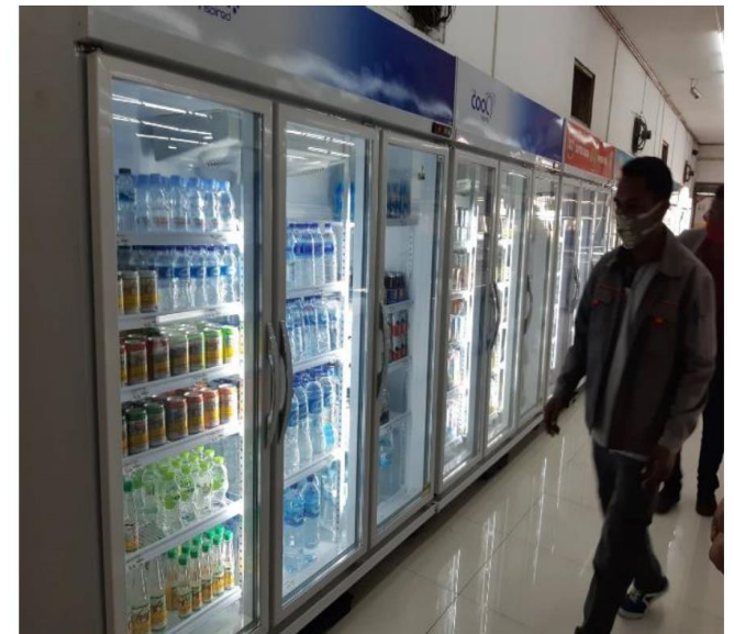
Figure 3- Standalone showcase for Drinks