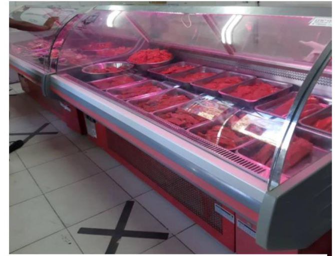
Figure 2- Standalone Display Unit for Meat Storage