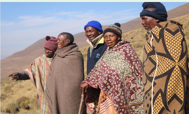
Some Executive Committee Members of Mofolaneng Grazing Association discussing rangeland resources management issues

The GEF SGP funding covers the incremental costs related to projects. Incremental costs are additional costs associated with transforming a project with national benefits into one with global environmental benefits. The Programme provides small grants, up to USD 50,000, directly to Civil Society Organizations and Community Based Organizations and other recognized community entities for environmental protection projects. The Programme thrives on partnerships and thus operates on a 1:1 financing arrangement. Contribution by grantees can be in cash and or in-kind and can be raised through partnerships with donors, government, academic and research institutions, private sector, business sector and other stakeholders.