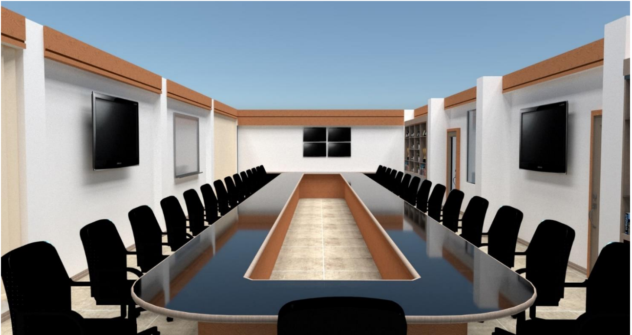
3D Perspective Interior with (04) No Bezel video wall screen. (02) 58" Side wall monitors .