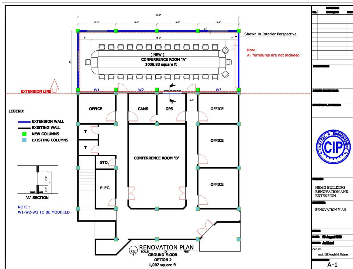
NEMO Extension Plan