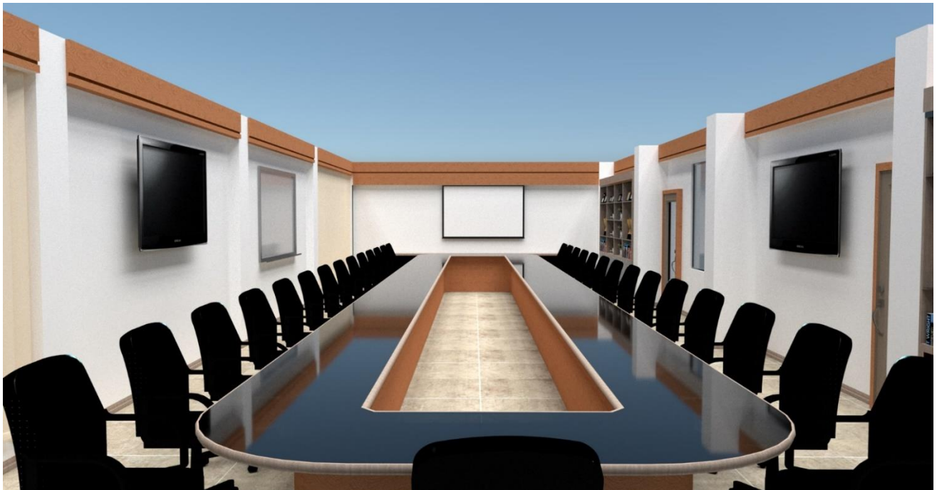
3D Perspective Interior with Automatic drop down projector wall screen. (02) side wall monitors