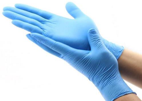
Image: Disposable Gloves