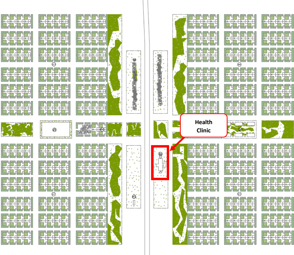
Figure 2: Global layout of Ngarannam Housing showing location