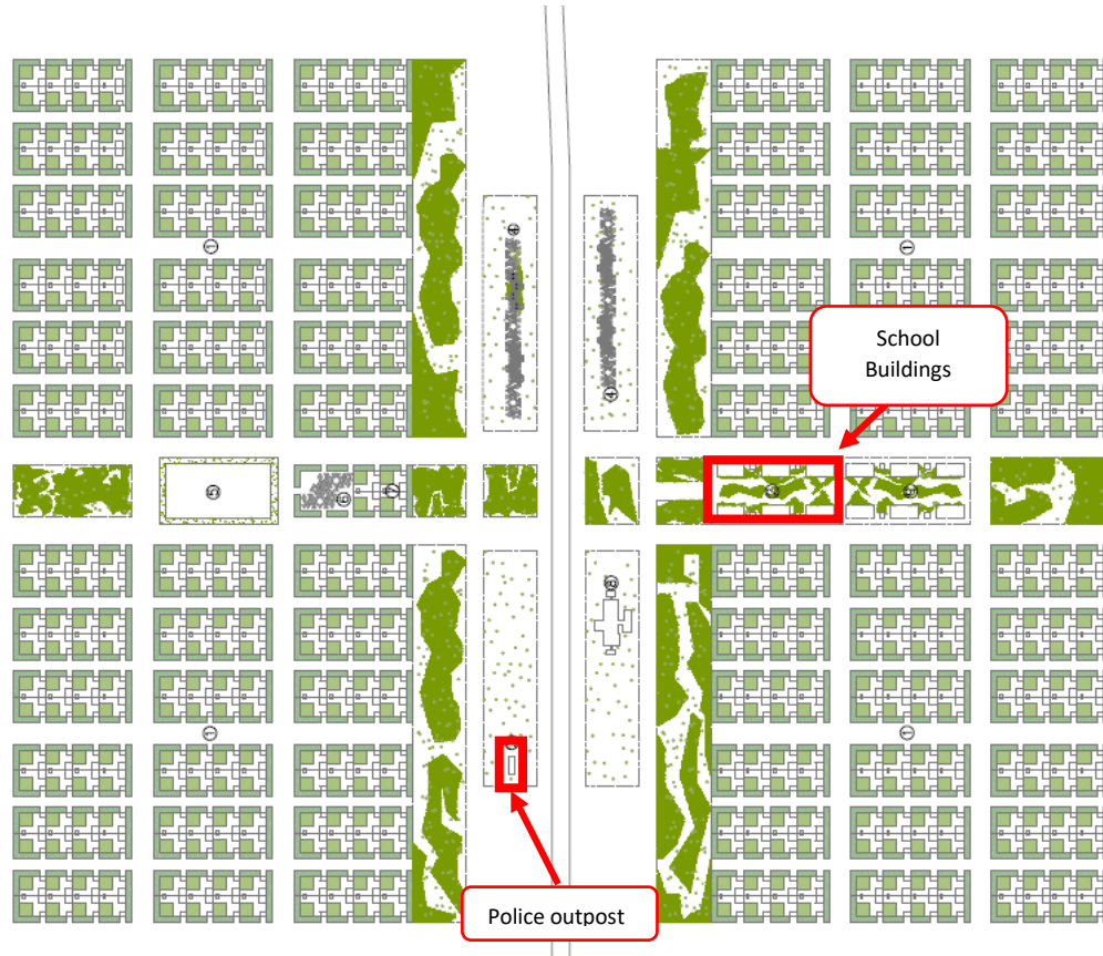
Figure 2: Global layout of Ngarannam Housing showing location