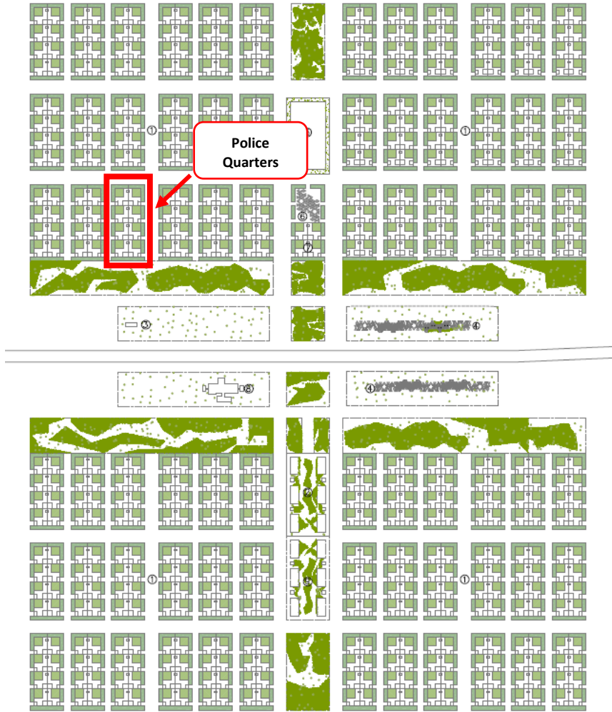
Figure 2: Global layout of Ngarannam Housing showing location