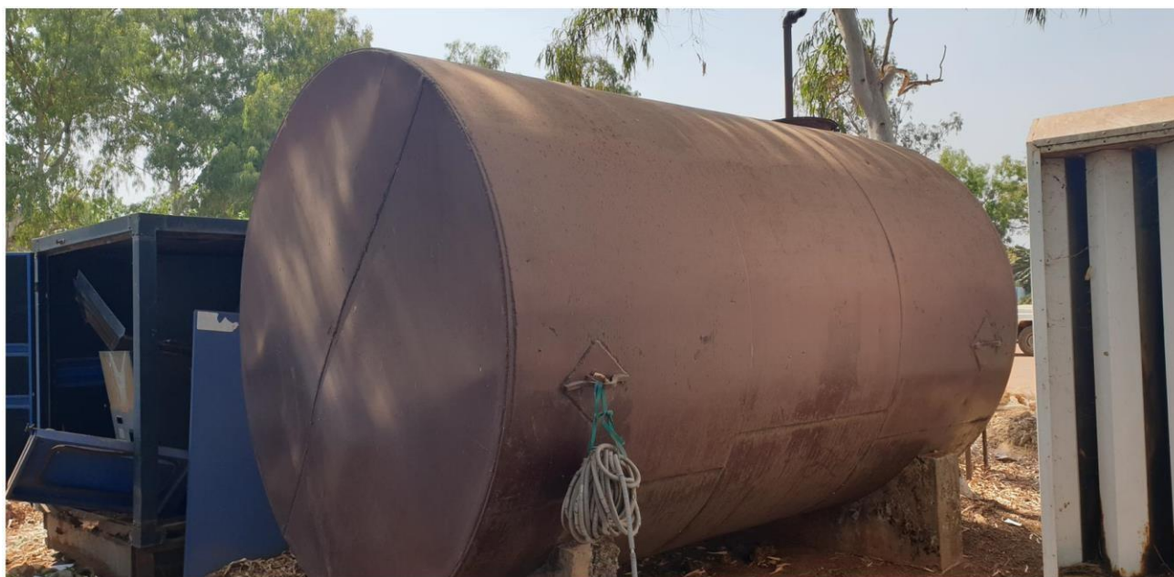
Photo of the Tank Containing the Old Fuel in UN Premises in Rua Rui Djassi, CP 179, PO Box 1011, Bissau: