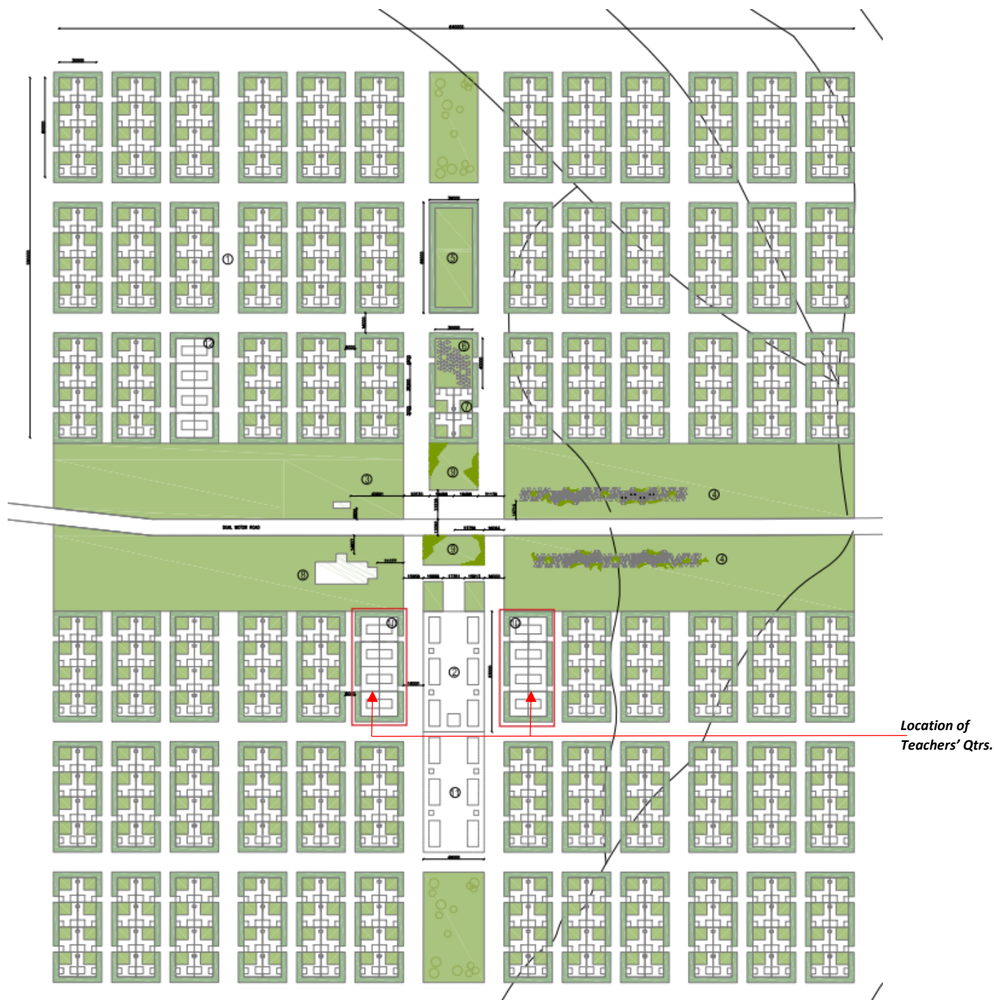
Figure 2: Global layout of Ngarannam Housing showing location of Teachers' Qtrs. encircled Blue.