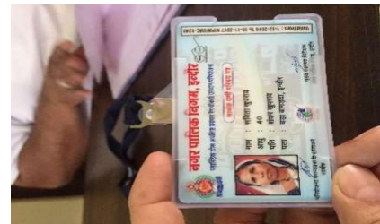
Figure 2: A sample of the Identity Card for the Safai Mitras.

These cards will be issued by the Urban Local Bodies along with the facilitating CBO/NGO/Institution. Each member in the SHGs formed will be linked with bank accounts individually and group based. Regular savings and credit systems will be created for the members to meet their immediate credit (access) needs through the banks. This will lead to the locals (waste pickers) to agree, take decisions, and sharing costs etc. so as to maximise efficiency and effectiveness.