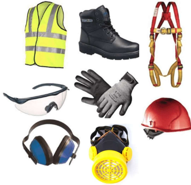
Figure 1 Occupational safety equipment